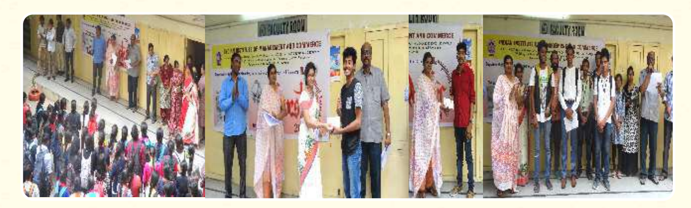
18. Haritha Haram by NSS 9.8.2018.