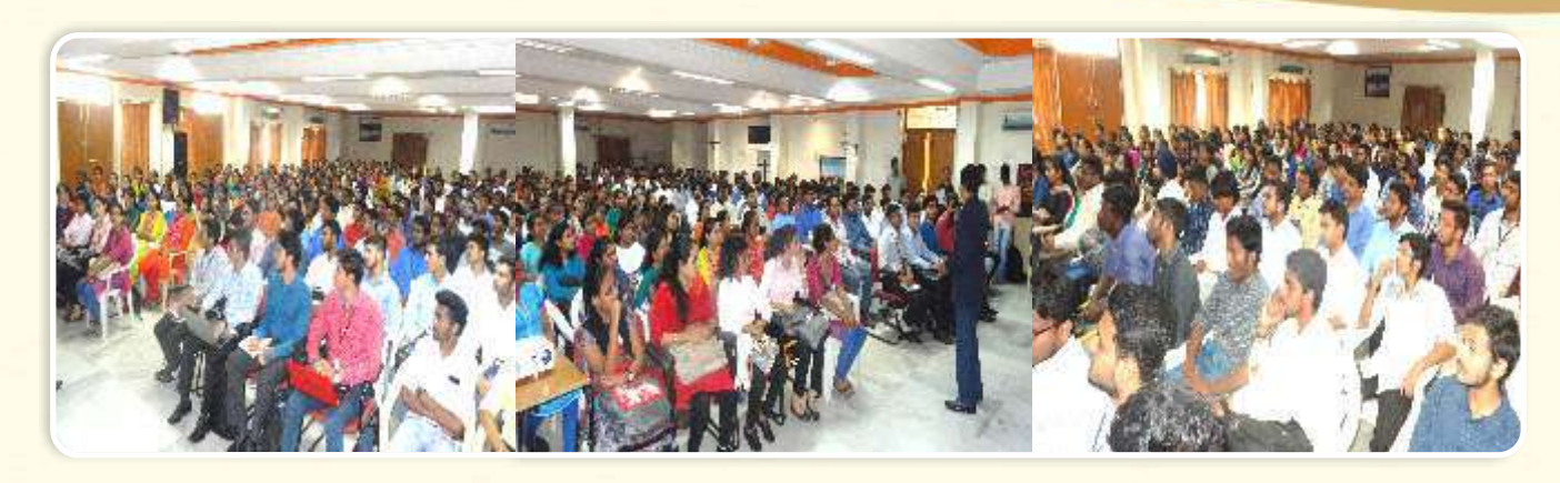
29. Teachers' Day Celebrations 5.9.2018.