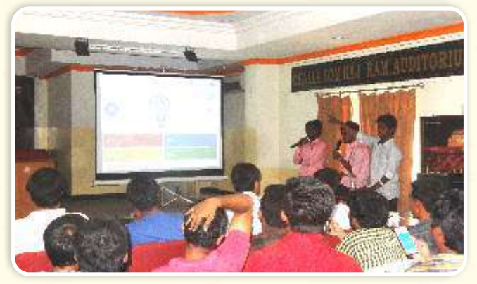
17. QUESTER: Management Talent Test 8.8.2018