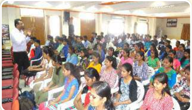
14. An FDP on Business Intelligence for Profits 2.8.2018.