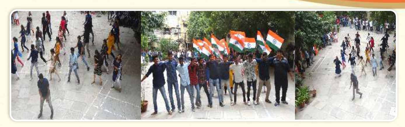
34. SAMSKRUTHI – The Traditional Day 7.9.2018.