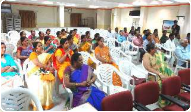
31. Teachers' Day Celebrations by the Students 6.9.2018.