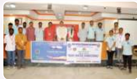
74. Career Bridge Connect: [3.10.2023]