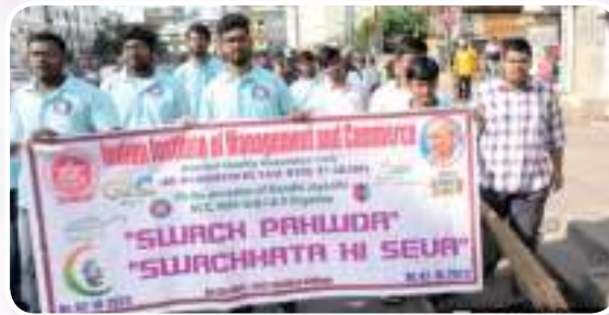
72. Swachata Hi Seva: [2.10.2023]